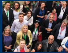
International news Page 4