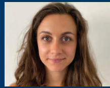
Staff updates Page 7