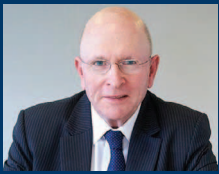
CHSS news Page 2