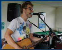
CHSS people Page 6