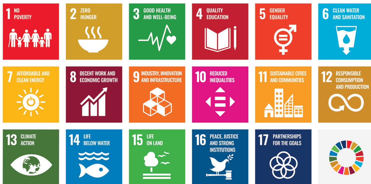
Figure 1: UN Sustainable Development Goals

The SDGs provide a useful starting point for staff and students interested in including SD content and challenges in modules, courses and practice. The breadth of the SDGs and the depth of the targets within each goal means that they can resonate with all academic disciplines and subject areas.