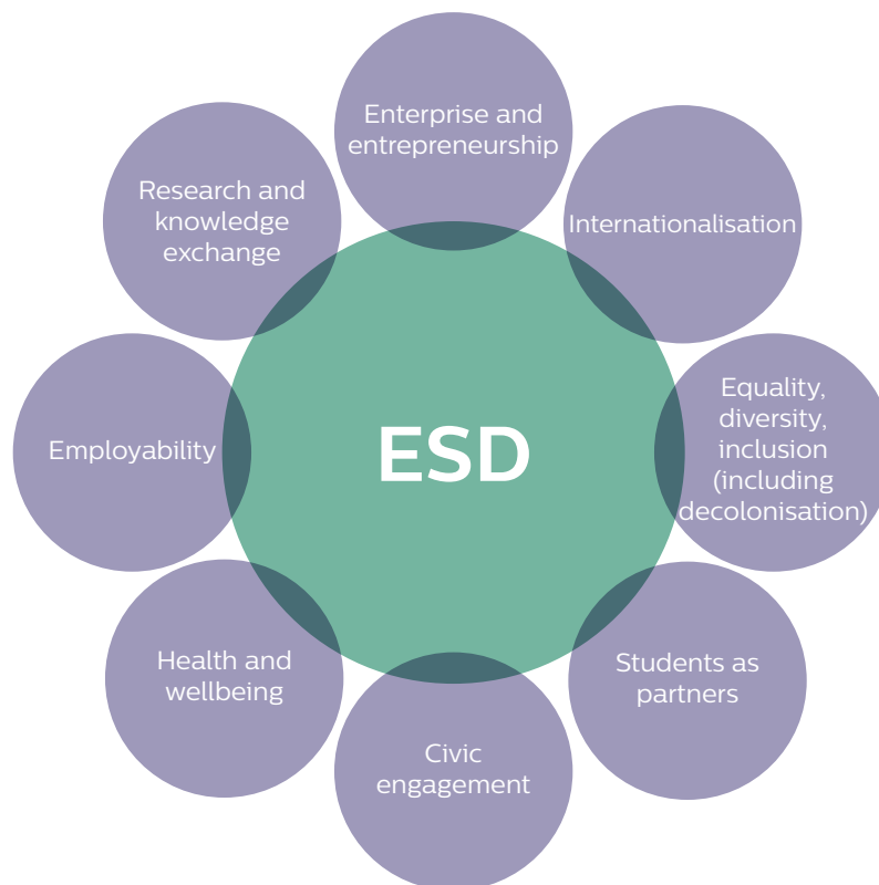
Figure 2: ESD intersections across strategic priorities for student success

The process of framing ESD within the curriculum is not a linear one. Instead, it requires ongoing and cyclical reflection and evaluation to consider what has and has not worked well, what can be improved, and how staff and students can continuously evidence the place and importance of ESD. Some HEPs may choose to start with a mapping exercise that examines where ESD already occurs and where it needs strengthening. However, it is important that the process of mapping does not become the focus and that energies are directed towards the outcomes wanting to be achieved.