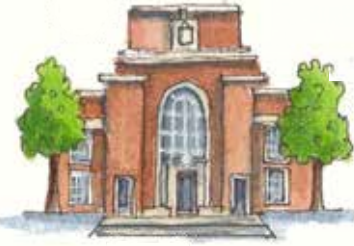
11 Town Hall The bronze bust of Mayor Whitbourn Emson, a gift from the town's 'Belgian Colony', (see 13) stands in the lobby of the Council Chamber (viewable only during Heritage Open Days ).