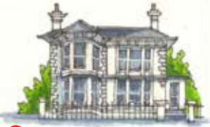
7 4 Lansdowne Road Home of Amelia and Louisa Scott