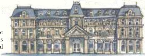
13 The Great Hall, Mount Pleasant Where the bust of the Mayor (see 11) was presented on 22nd September 1915.