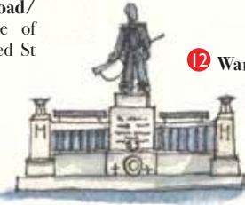
12 War Memorial