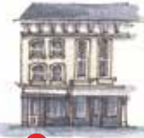
5 Constitutional Club, 32-38 Calverley Road The Belgians' social club, the Club Albert, met in this building. Membership of the club entitled them to free entry to film showings at the Kosmos Kinema Picture House next door at no.40. To the right at the crossroads is Monson Road where apartment accommodation was provided.