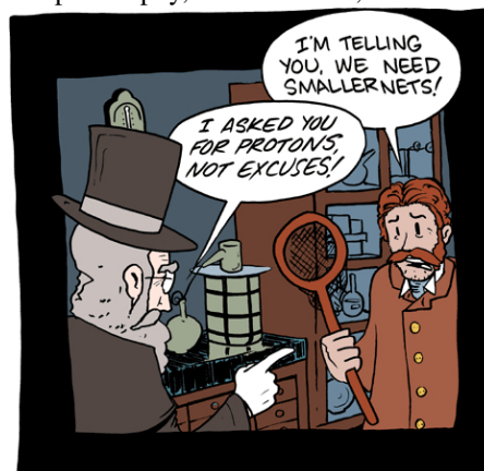
Particle physics has come a long way since the 1700s.

PHD: in Neurophilosophy, LMU Munich, deadline 15 February.