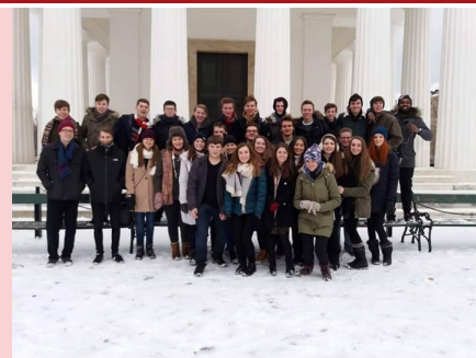
History Society, trip to Vienna 2017

The History Society is the biggest academic society on campus here at the University of Kent, which is something that the committee and the society's members are incredibly proud of. Although the majority of our members are history students, both undergraduate and postgraduate level, the History Society welcomes all students. The society therefore comprises of those who study history but also those that simply have a passion for the subject.