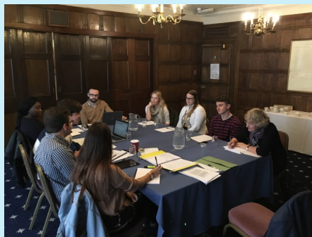
HI6086 Class at White Hart Hotel