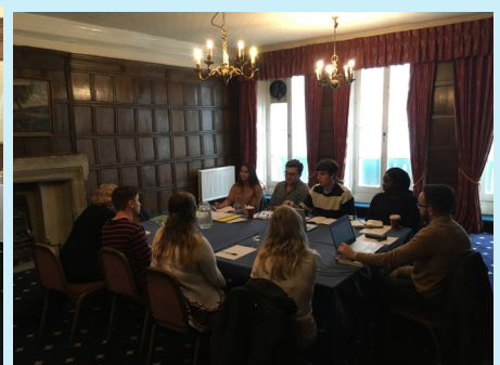
HI6086 Class in White Hart Hotel