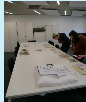
Kent Students investigated the unique and distinctive materials in Special Collections