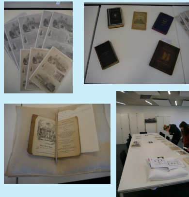
Templeman's sources rare materials